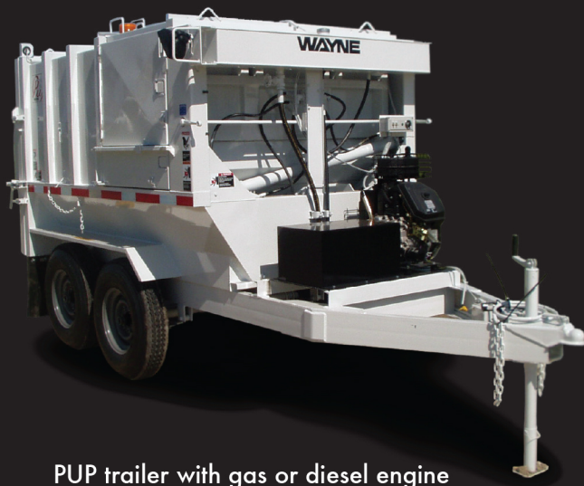
PUP trailer with gas or diesel engine